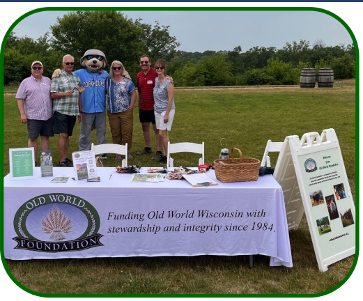
Greeting Guests at Independence Days